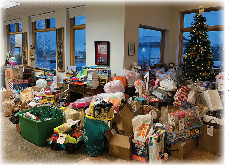
2023 CLP Toy Drive Donations

Over the years, the toy drive has seen remarkable growth and improvement thanks to the dedication and generosity